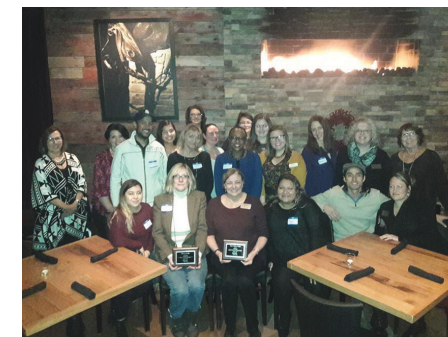
2017 Volunteer Award Night

Nicor and their employees for all that they have done for us this year, including volunteering in the shelter and helping beautify our yard.