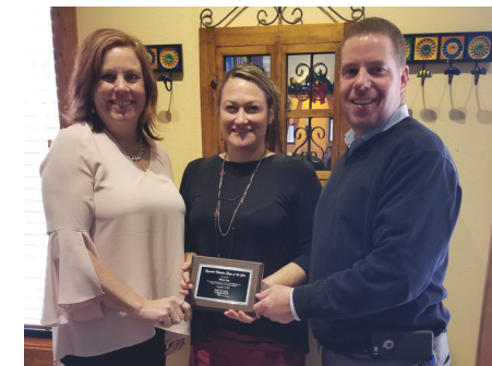
2017 Corporate Volunteer of the Year, Nicor

This past year we had many amazing companies and individuals volunteer with us. In Fiscal Year 2017, we had 938 volunteers that provided a total of 11,169 hours of service! Each year we host a Volunteer Awards Night to celebrate all of our incredible volunteers, and honor those companies and individuals who have gone above and beyond to help Mutual Ground.